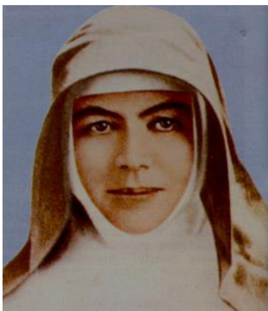
Saint Mary of the Cross MacKillop

Do your best and God will bless your efforts